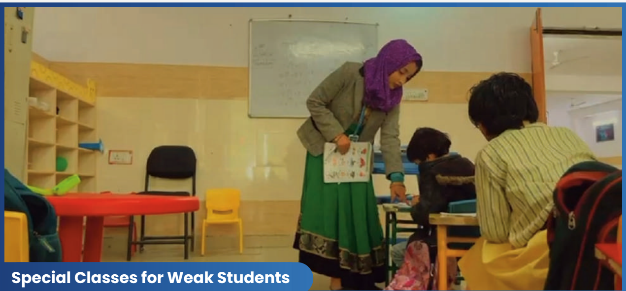
Special Classes for Weak Students