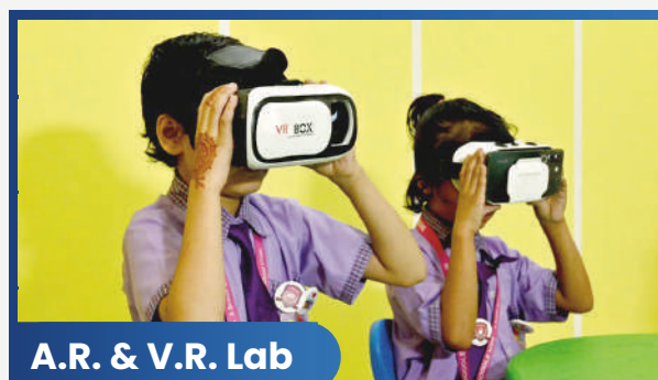
A.R. & V.R. Lab