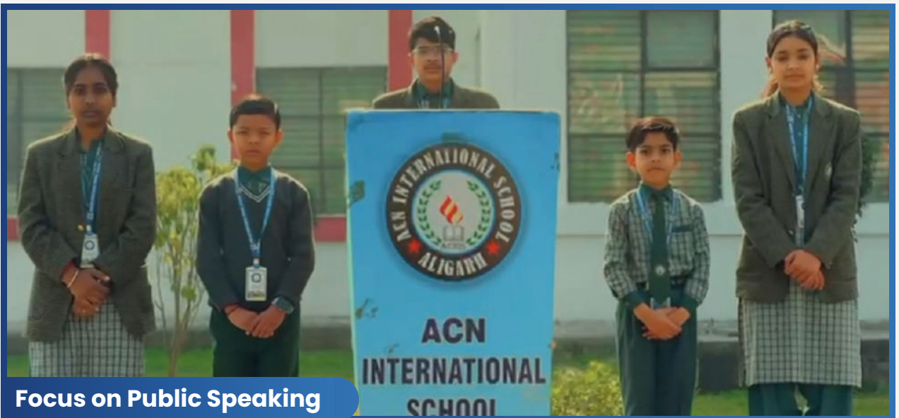
Focus on Public Speaking