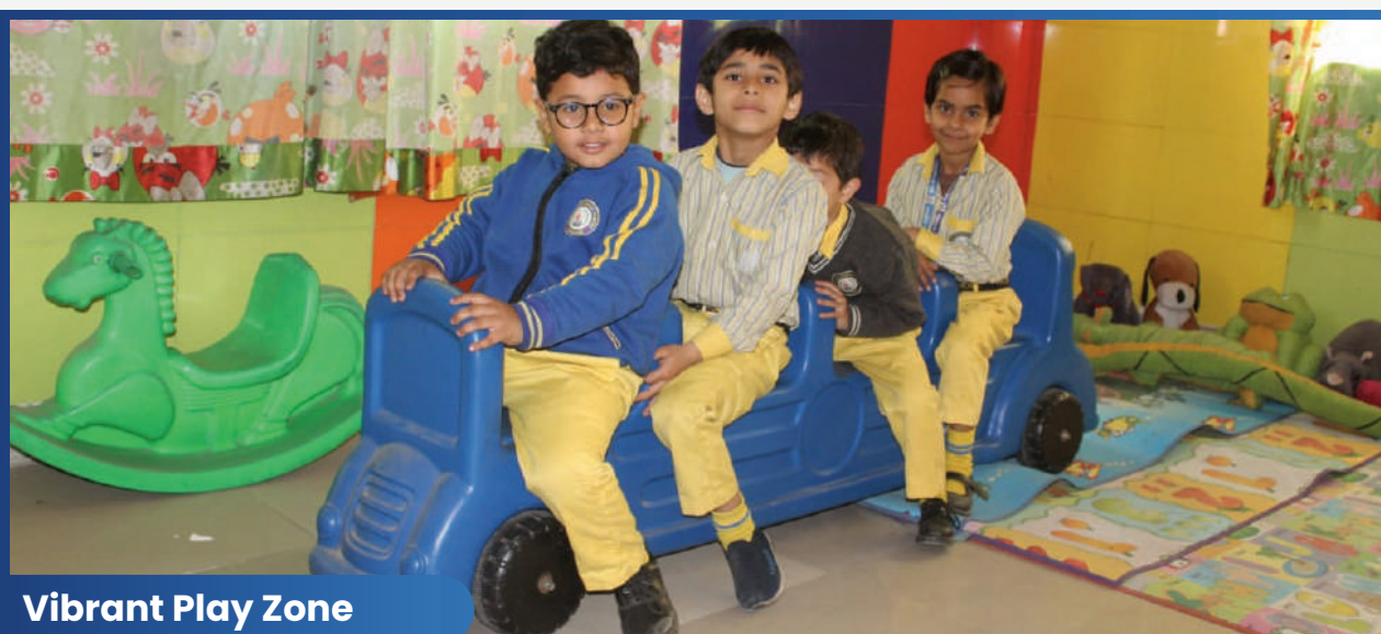
Vibrant Play Zone