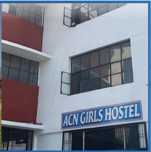
Separate Hostel for Boys & Girls