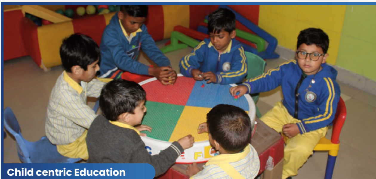
Child centric Education