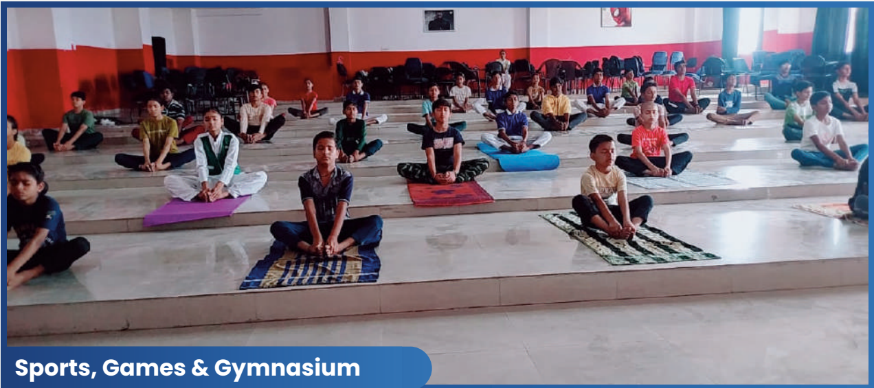
Sports, Games & Gymnasium