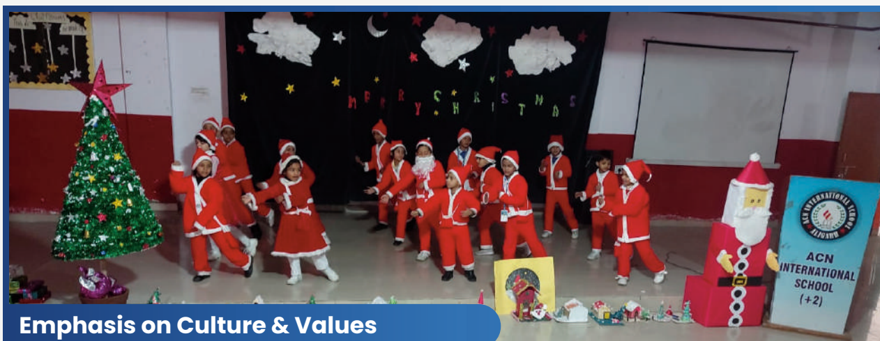
Emphasis on Culture & Values